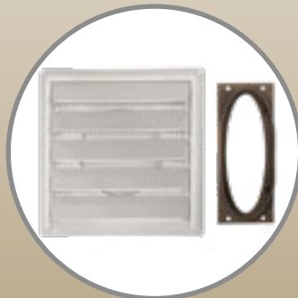
FRESH AIR KIT